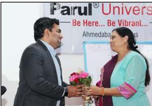
World Cancer Day. Was celebrated on 4th Feb 2022 in AHMC