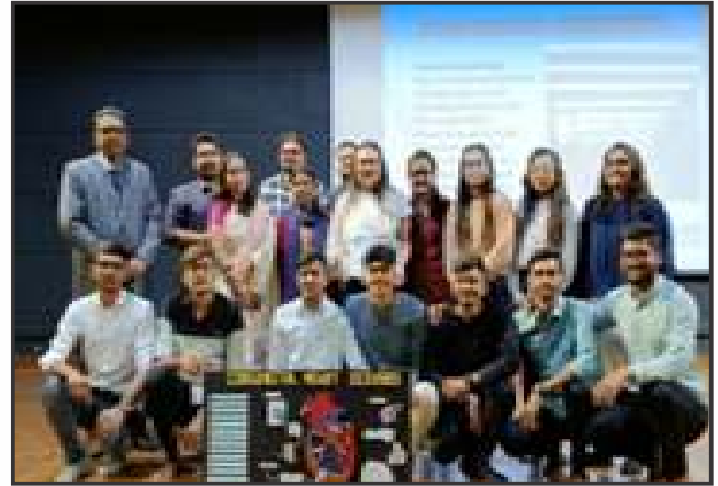
Department of Surgery Jawaharlal Nehru Homoeopathic Medical College, Parul University organized a “Workshop” on 05/02/2022 at 09:30am at Central Auditorium, Parul University.