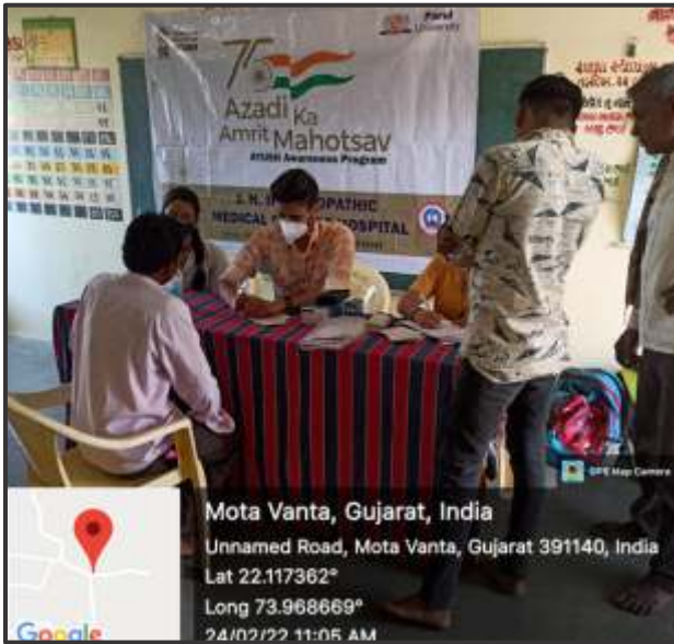
Mota Vanta, Gujarat, India Unnamed Road, Mota Vanta, Gujarat 391140, India Lat 22.117362° Long 73.968669° 24/02/22 11:05 AM