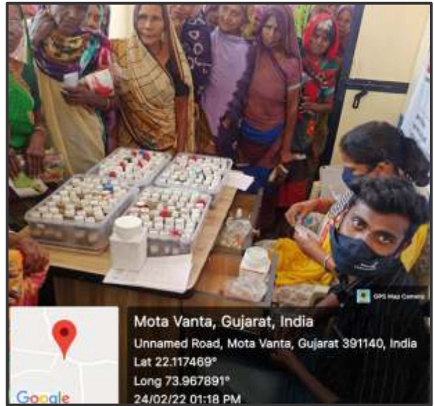
Mota Vanta, Gujarat, India Unnamed Road, Mota Vanta, Gujarat 391140, India Lat 22.117469° Long 73.967891° 24/02/22 01:18 PM