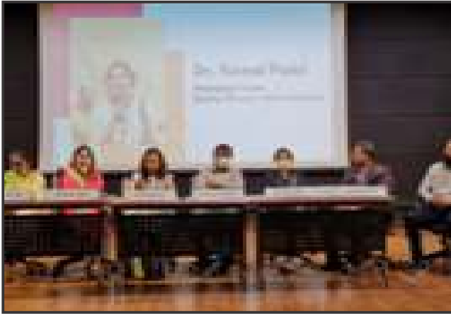
Organon of Medicine department of Jawaharlal Nehru Homoeopathic Medical College, Parul University organized a “Workshop” on 03/02/2022 at 09:30am at Central Auditorium, Parul University.