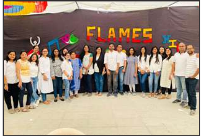
Celebrations of Days at Ahmedabad Homoeopathic Medical College. 24, 25 and 26th February