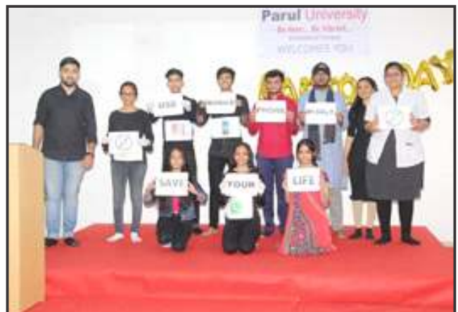
World Radio Day was celebrated in AHMC campus on 13th Feb 2022