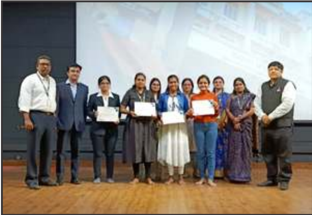
Department of Homoeopathic Materia Medica Jawaharlal Nehru Homoeopathic Medical College, Parul University organized a “Symposium” on 23/02/2022 at 1:30pm at Central Auditorium, Parul University